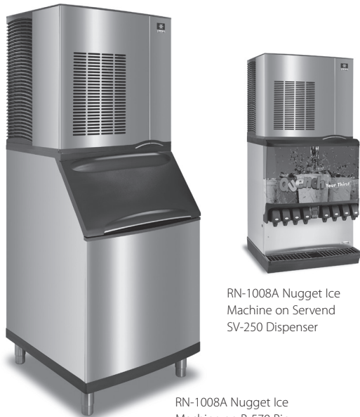
RN-1008A Nugget Ice Machine on B-570 Bin