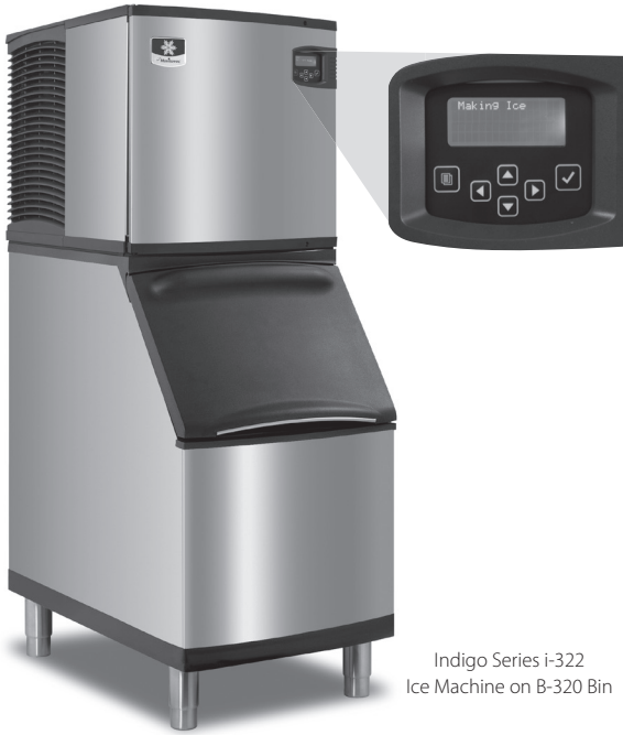
Indigo Series i-322 Ice Machine on B-320 Bin

Designed for operators who know that ice is critical to their business, the Indigo™ Series ice machine's preventative diagnostics continually monitor itself for reliable ice production. Improvements in cleanability and programmability make your ice machine easy to own and less expensive to operate.