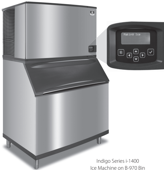
Indigo Series i-1400 Ice Machine on B-970 Bin

Designed for operators who know that ice is critical to their business, the Indigo™ Series ice machine's preventative diagnostics continually monitor itself for reliable ice production. Improvements in cleanliness and programmability make your ice machine easy to own and less expensive to operate.