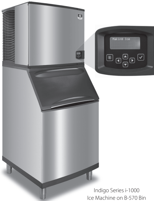
Indigo Series i-1000 Ice Machine on B-570 Bin

Designed for operators who know that ice is critical to their business, the Indigo™ Series ice machine's preventative diagnostics continually monitor itself for reliable ice production. Improvements in cleanability and programmability make your ice machine easy to own and less expensive to operate.