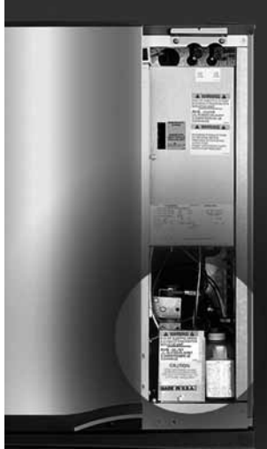
AuCS – SI (Internal Mounting)