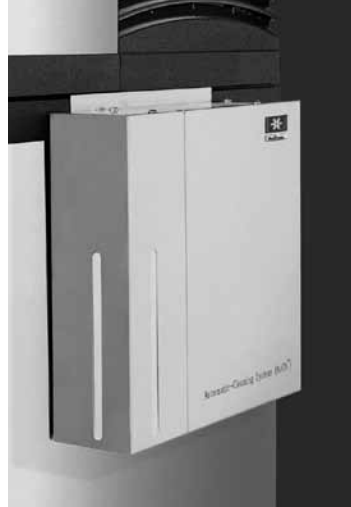
AuCS – SO (External Mounting)