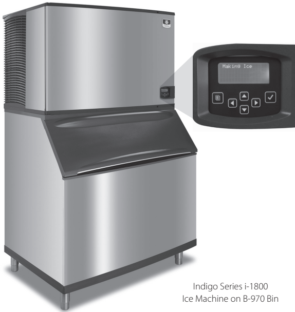
Indigo Series i-1800 Ice Machine on B-970 Bin

Model: IR-1800A ID-1802A IR-1890N ID-1803W IY-1804A IY-1805W IY-1894N ID-1892N